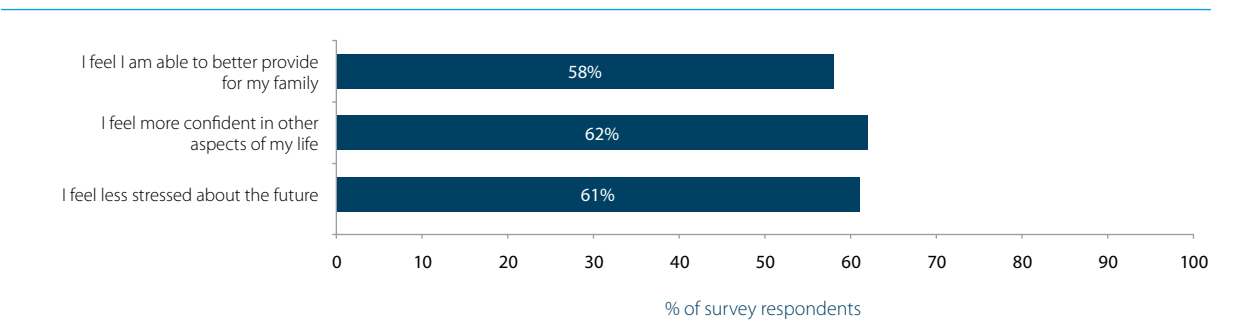
FIGURE 2. WELLBEING OUTCOMES FOR RESPONDENTS ('AGREE' OR 'STRONGLY AGREE')

"I feel like the thing that bothered me the most was when I am on my own. When I am with friends, they're also money minded. When I'm alone I think, 'oh, I should just buy it', but when I'm with my friends, they're like 'is that even worth it? I've already got one. So, you can just borrow it'. They couldn't make an impulse buy, it's not worth it." (Participant, discussion group)